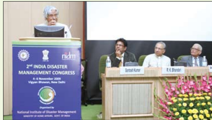
Valedictory Ceremony of Second India Disaster Management Congress

NIDM has been implementing the Central Sector Scheme for providing financial assistance to State ATIs/ other Institutions for operation of Faculty/ Centre of Disaster Management. Presently 30 such Centres are operational in the country. Each Centre conducts about 25 training courses and train