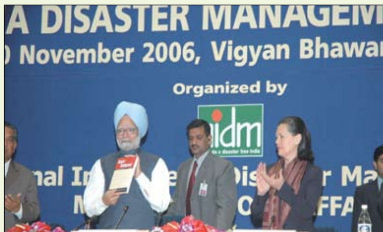
Inaugural Ceremony of First India Disaster Management Congress

The National Institute of Disaster Management constituted under the Disaster Management Act 2005 has been entrusted with the nodal national responsibility for human resource development, capacity building, training, research, documentation and policy advocacy in the field of disaster management. Upgraded from the National Centre for Disaster Management of the Indian Institute of Public Administration on 16th October, 2003, NIDM is steadily marching forward to fulfill its mission to make a disaster resilient India by developing and promoting a culture of prevention and preparedness at all levels.